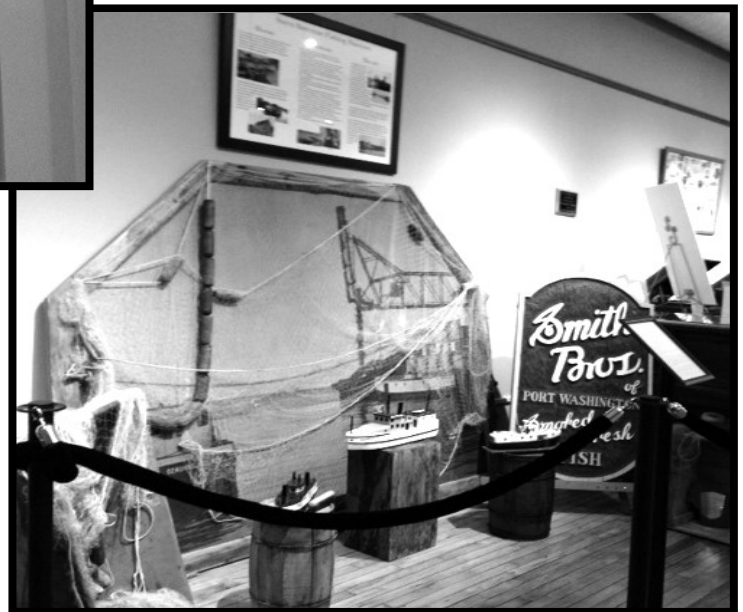
Smith Bros. Commercial Fishing exhibit