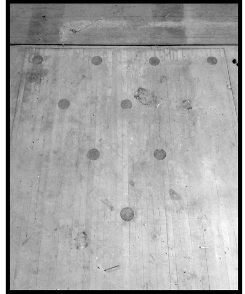
Bowling pin markers on floor are still visible