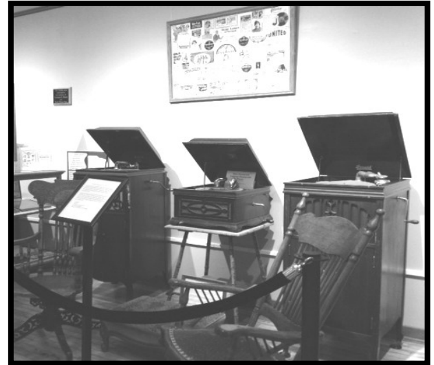
Paramount Records exhibit

These exhibit areas will change later in spring to reflect a maritime theme for the summer and fall months.