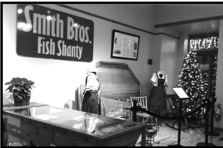
Smith Bros. Restaurant display

first level. Currently, during the winter months, the exhibits are: Smith Bros. Restaurant, Smith Bros. Commercial Fishing, and the Wisconsin Chair Company and Paramount Records.