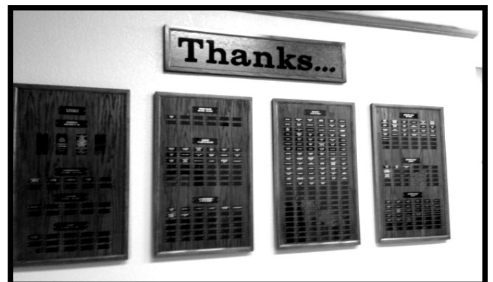
Donor plaques at the Resource Center

The light station has been cleaned from ceiling to floors including woodwork. The floors have been cleaned and polished in anticipation of our next season. There is some painting to be done on the upper floors and the lantern, but that will have to wait until warmer weather. Alice Horton donated a Bolens snow blower which is certainly coming in handy this winter.