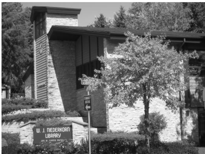
The City of Port Washington's beautiful library, the W. J. Niederkorn Library located at 316 W. Grand Avenue