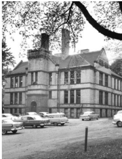
Wisconsin Street School, a previous location of the city library.