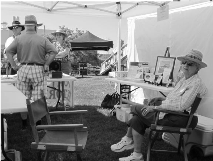
Volunteers help visitors at the outdoor tent at MHF.

climb descend with smiles and raves of the scenery. If you haven't done it put it down on your list for next summer.