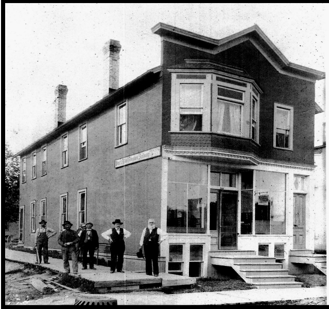
The Zeitung newspaper office at the corner of Milwaukee and Grand

As in many other small communities, small newspapers sprang up and flourished, sometimes for a short period of time. Stop in at the Resource Center and see this latest addition!