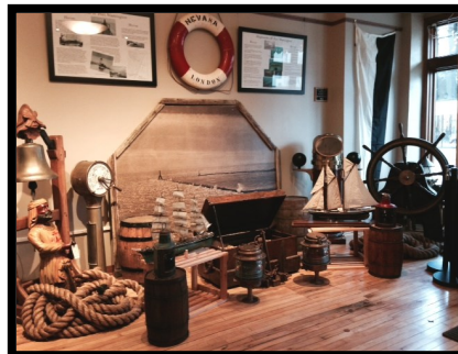
First floor display area

Several recent projects over the past four years have been the recording of oral histories of older members and residents, capturing their stories, memories, and perspectives on the changing community. More than 30 tapings have been made to date. Another project has been the ongoing designation of historic markers, assisting property owners and Eagle Scout candidates. Another