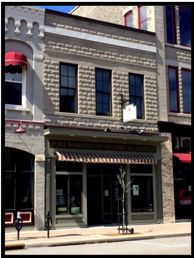
Exterior, after restoration