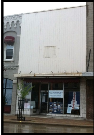
Exterior, before restoration

Volunteers work with local businesses to provide information and photos for newspaper articles, commemorations, displays in local businesses, and restoration efforts, as well as continuing to assist individuals researching family histories, local lore, properties, and events. Volunteer researchers help compile information for projects, collection work, and research requests. Volunteers allow the Resource Center to be open to the public four days a week during the summer and fall seasons. Nearly thirty volunteers work on a monthly basis to manage the work of the Resource Center.