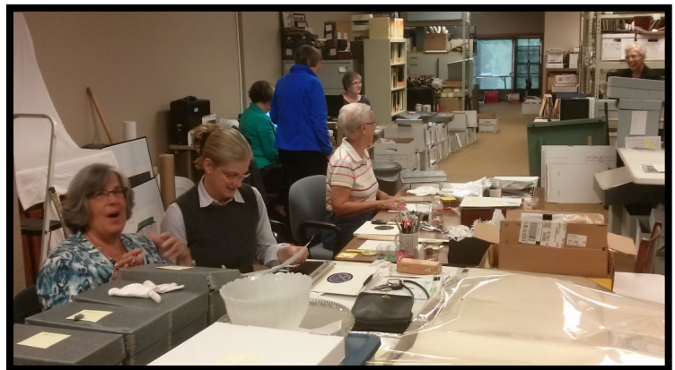
Second floor work area

Several recent projects over the past four years have been the recording of oral histories of older members and residents, capturing their stories, memories, and perspectives on the changing community. More than 30 tapings have been made to date. Another project has been the ongoing designation of historic markers, assisting property owners and Eagle Scout candidates. Another